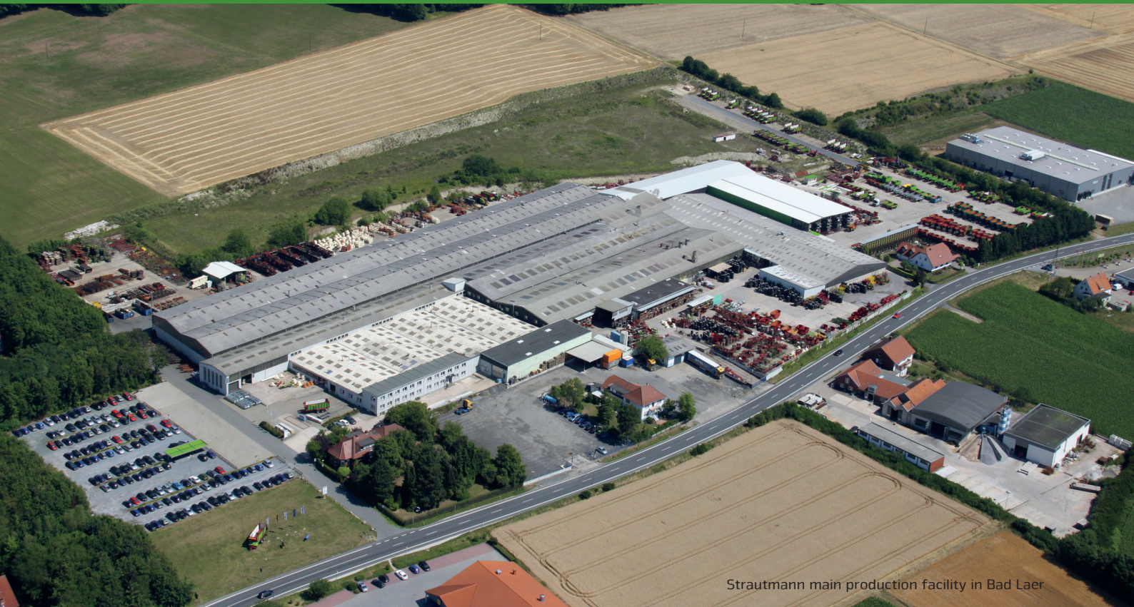
Strautmann main production facility in Bad Laer

B. Strautmann & Söhne GmbH u. Co. KG is a medium-sized family-owned company from southern Lower Saxony having already celebrated its 80th anniversary of existence and now being managed by the third generation. In a modern plant at the second production site in Lwówek (Poland), Strautmann manufactures individual machine components and, apart from that, also parts of the